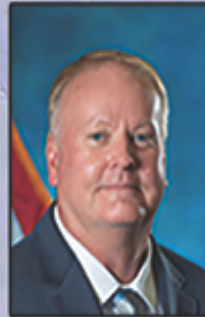
Guest Speaker Crown Point Mayor Pete Land